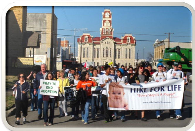
The 2014 Hike for Life heads down Main Street en route back to the Club House.

For more information visit: www.hikeforlifetexas.com